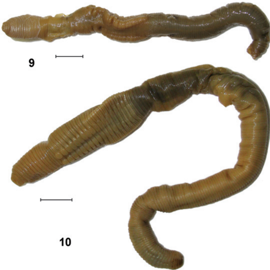
Figs 9, 10. Habitus of Geogenia benhami (9) and G. mkuzi (10). Scale bars = 1 cm.

Not much is known about the species' type locality, other than that it was found in the northern part of Namaqualand. From the data given for the other species mentioned in the species description, it might be concluded that namaensis was found together with the introduced Microscolex phosphoreus (Dugès, 1837) and Aporrectodea caliginosa (Savigny, 1826), possibly in a newly created garden, or introduced from some other site.