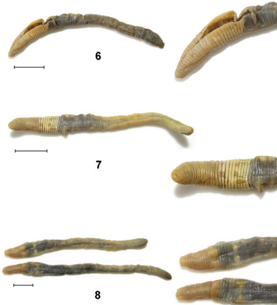
Figs 6–8. Habitus and enlarged clitellar area of Proandricus species: (6) P. adami , (7) P. amphius , (8) P. oresbiosus . Scale bars = 1 cm.

The Mont-aux-Sources area, located in the northern part of the central Drakensberg, is adjacent to the Royal Natal National Park, and the new collecting site lies in the