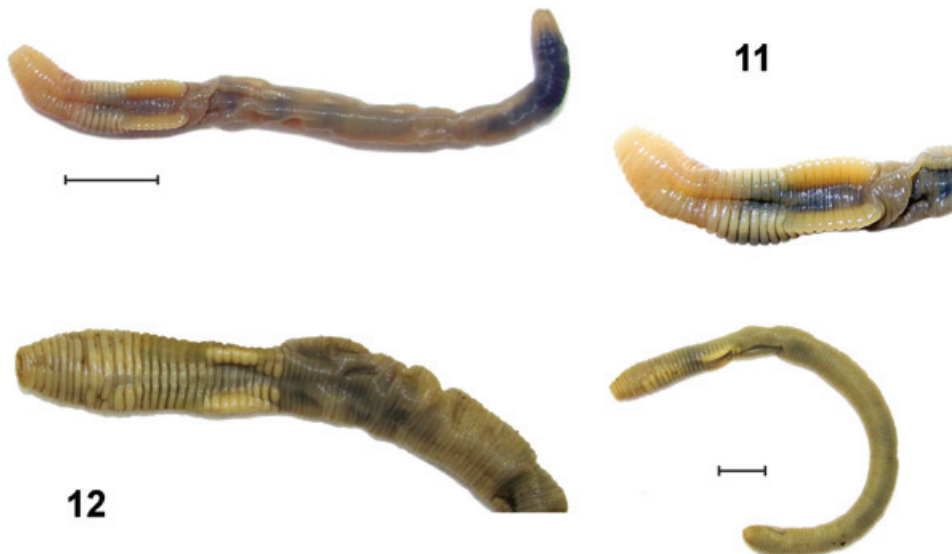
Figs 11, 12. Habitus and enlarged clitellar area of Geogenia distasmosa (11) and G. quaera (12). Scale bars = 1 cm.

Unfortunately, the type specimen NMSA/Olig.03907 is in unsatisfactory condition for examination. From the original species description it is known that one pair of small spermathecae occurs in segment 9, and a single spermatheca at the right side in segment 10. Their spermathecal pores have been observed during species dissection in