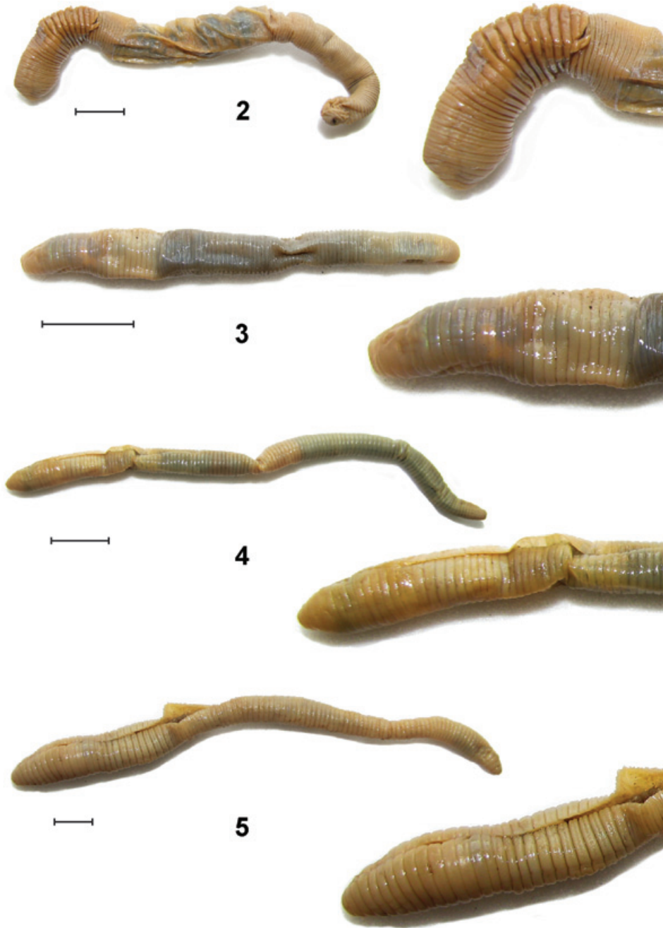
Figs 2–5. Habitus and enlarged clitellar area of Proandricus species: (2) P. lesothoensis , (3) P. pajori , (4) P. bourquini , (5) P. sani . Scale bars = 1 cm.